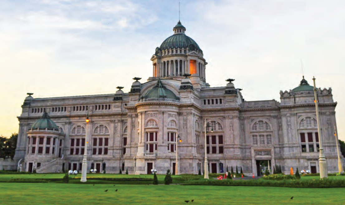
Anantasamakhom Throne Hall

as well as his life after abdication and death in the United Kingdom.