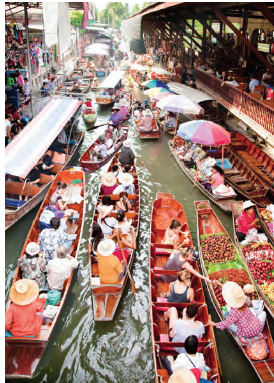
Damnoen Saduak Floating Market, Ratchaburi