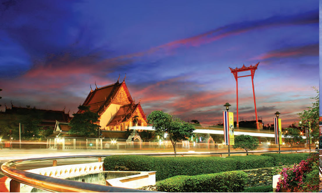
Wat Suthat and the Giant Swing

Rama IV bought the plantation and had a small temple constructed there, naming it “Wat Ratchapradit Sathitthammayutikaram”. Later, he had the name changed to “Wat Ratchapradit Sathitmahasimaram”. A place of interest in this temple is Phra Wihan Luang - the royal image hall - which houses mural paintings depicting “The Royal Ceremonies over 12 Months” and legend of the solar eclipse phenomenon.