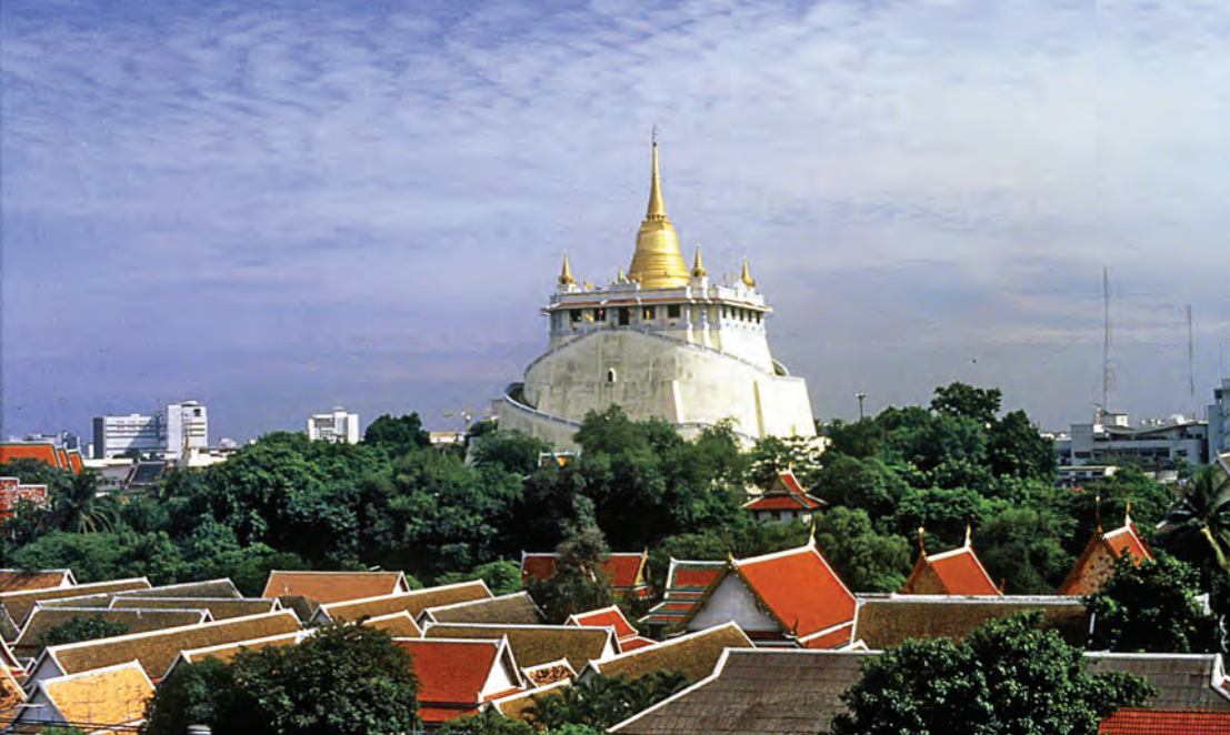
Wat Saket and the Golden Mount

Open : Daily from 08.30 a.m.- 08.00 p.m.