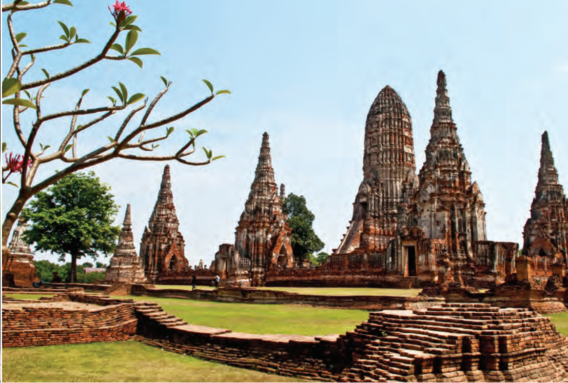
Ayutthaya Historical Park, Ayutthaya