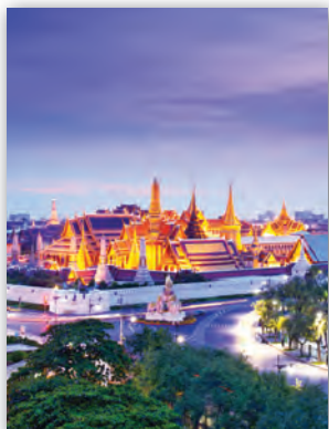
Wat Phra Kaeo