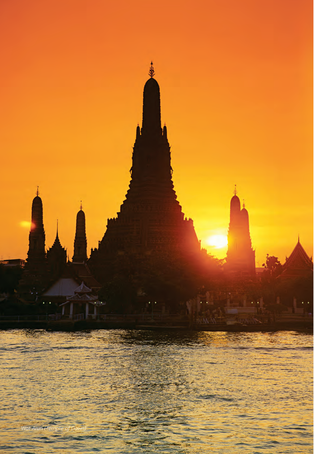
Wat Arun (Temple of Dawn)