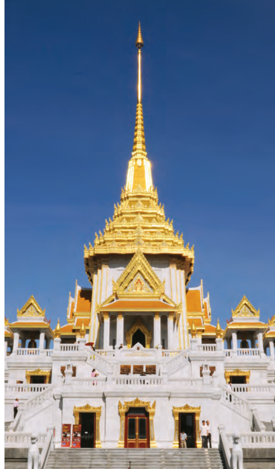
Wat Trai Mit

Haroon Mosque (มัสยิดฮารูน) The mosque is located on Charoen Krung 36 Road, was built in 1901 with two storeys stucco. The interior is decorated in Muslim style with wooden craft. They are some religious leader from other country had visited. The mosque warmly welcomes all visitors.