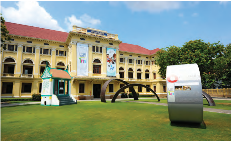
Museum Siam Discovery Museum

Rattanakosin Exhibition Hall (นิทรรศน์รัตนโกสินทร์) Located on Ratchadamnoen Klang Avenue in the old building next to the Lan Phlapphla Maha Chetsada Bodin Pavilion. The Crown Property Bureau renovated and decorated the original building to become a learning centre compiling historical knowledge