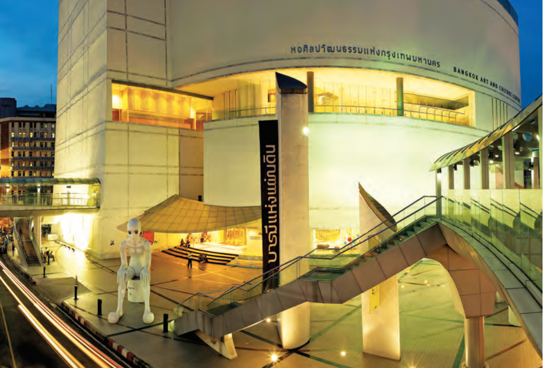
Bangkok Art and Culture Centre

Bangkok Art and Culture Centre (หอศิลป์วัฒนธรรมแห่งประเทศไทย) The Bangkok Art and Culture Centre (BACC) is located at the Pathumwan Intersection, facing the MBK and Siam Discovery Centres. It is a new mid-town facility for the contemporary arts. Programmes for art, music, theatre, film, design, and cultural/educational events take place in a friendly and recreational atmosphere - with cafe, restaurants, bookshops, and an art library being part of the facility. The BACC aims to create a meeting place for artists, to provide cultural programmes for the community giving importance to cultural continuity from past to contemporary. It aims to open new grounds for cultural dialogue,