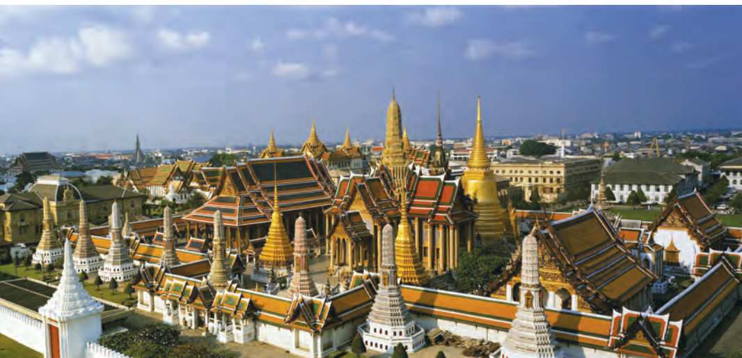
Wat Phra Kaeo or Temple of the Emerald Buddha

Bus : No. 1, 3, 9, 15, 25, 30, 32, 33, 43, 44, 47, 53, 59, 60, 64, 82, 91, 203, 503, 507, 508 Tel : 0 2623 5500 ext 3100 www.palaces.thai.net