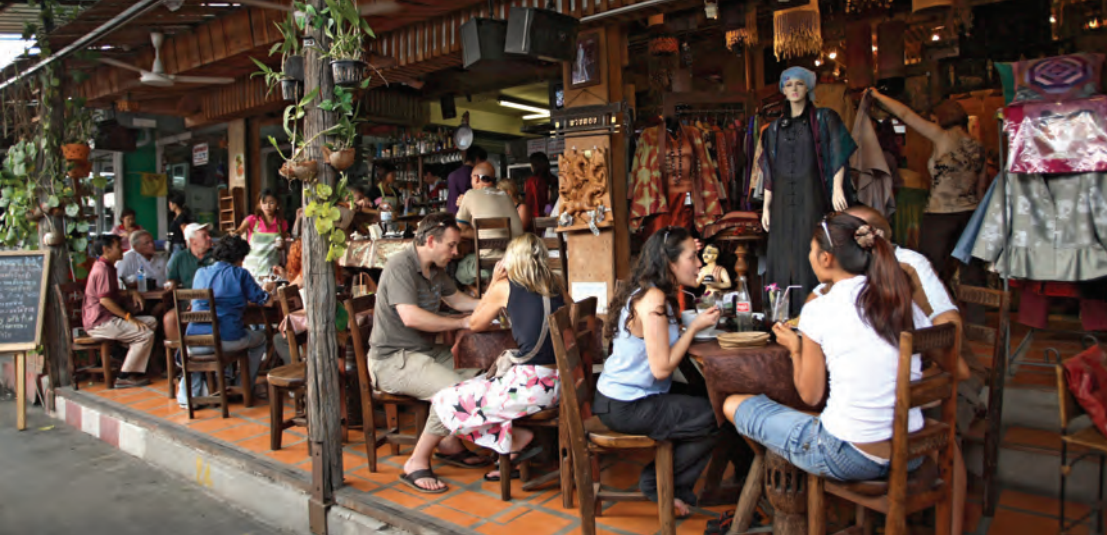
Chatuchak Weekend Market

Bang Lamphu (บางลำพู) Bang Lamphu is a market in the old town of Bangkok where clothing, food are popular buy. Besides shopping, many restaurants, hotels and guesthouses are located. Most of the bag packers choosing this area for visiting Thailand.