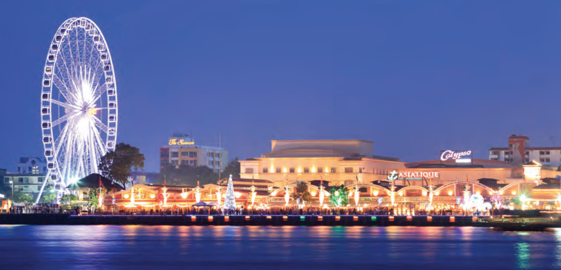
ASIA TIQUE The Riverfront