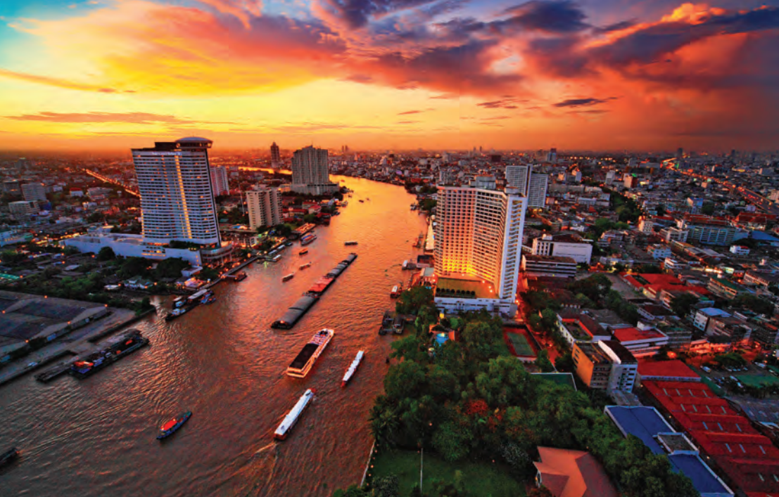
Chao Phraya River

on a canal side. The 3-hour tour operates once a day at 01.30 p.m. Ticket 99 Baht for adults and 60 Baht for children.