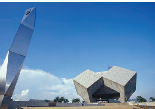
National Science Museum Thailand, Pathum Thani

Damnoen Saduak Floating Market (ตลาดน้ำดำเนินสะดวก) This popular attraction is some 80 Kilometres west of Bangkok. Every morning till noon, boat vendors will sell product from their plantations that varies from fruits to vegetables. Check in early morning and take a ride on a row boat to get the real sense of floating market.