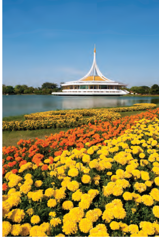
Suan Luang Rama IX

Shopping in Bangkok is not limited to one or two major streets. There are many areas throughout Bangkok affording ample choices and easy access. The following is just a selection of some of the principal shopping areas.