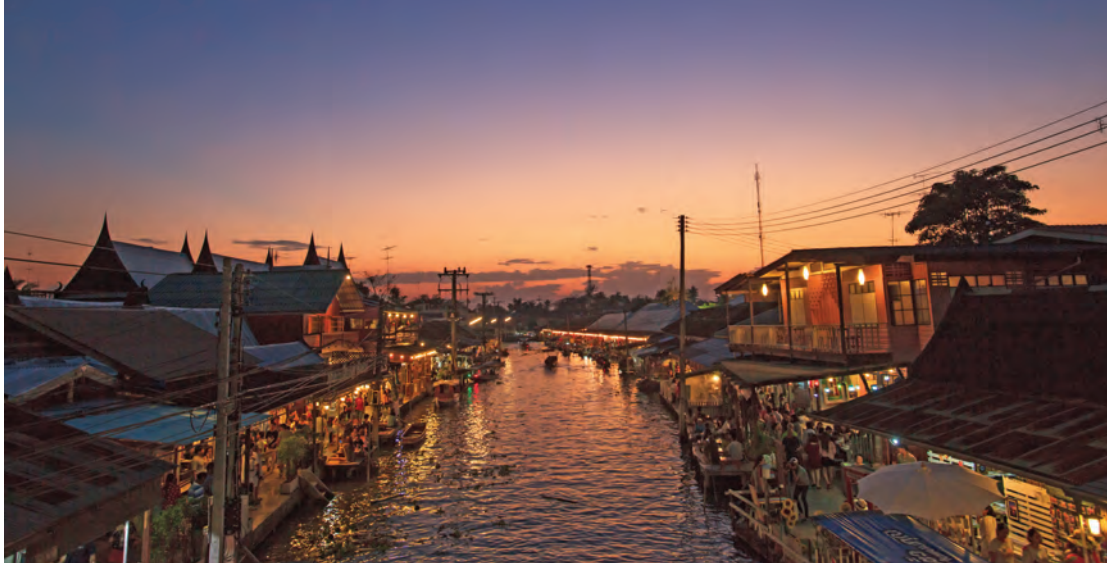
Amphawa Floating Market, Samut Songkhram

park with a large pond providing a gazebo for relaxation. In the back part stays the original environment of the park and is a habitat of the community. This is also a place for studying local flora, and agricultural crops, which includes a 7-metre high birdwatching tower. In addition, there is a bike route to explore community's ways of life, homestay or a boat ride.