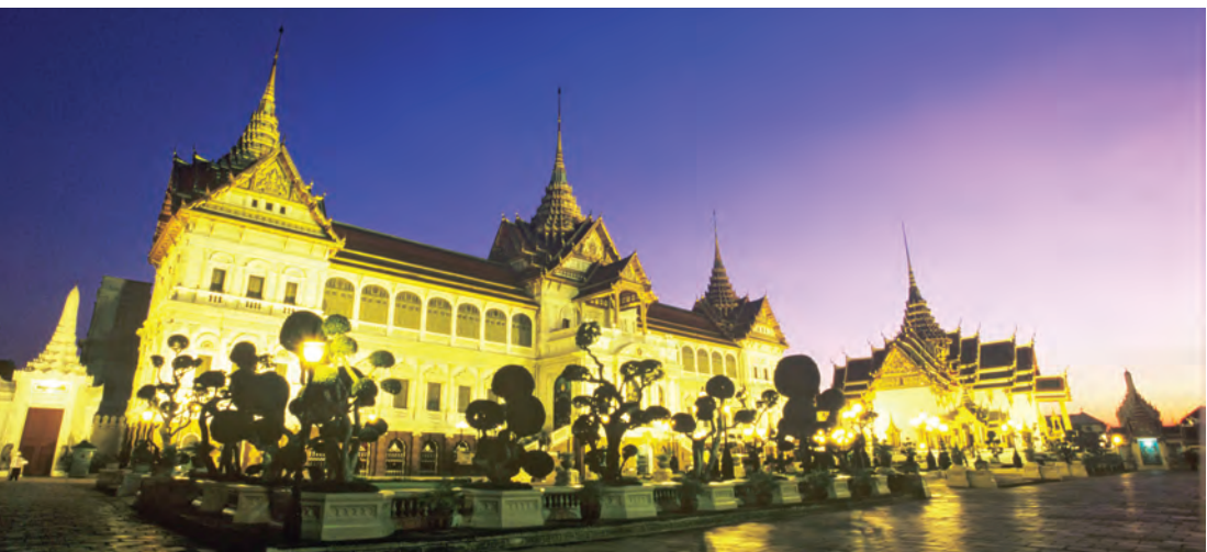
Phra Thinang Chakri Maha Prasat

Admission : 500 Baht. (including a ticket to Vimanmek Royal Mansion or Anantasamakhom Throne Hall). Proper attire is essential Audio Guide in Thai, English, French, German, Spanish, Russian, Japanese and Mandarin: 400 Baht