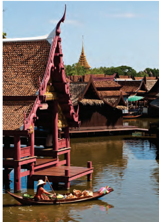
Ancient City, Samut Prakan

BTS : Take BTS to Bearing station exit 1, the free shuttle bus (3 times/ day) park at Soi Sukhumvit 105.