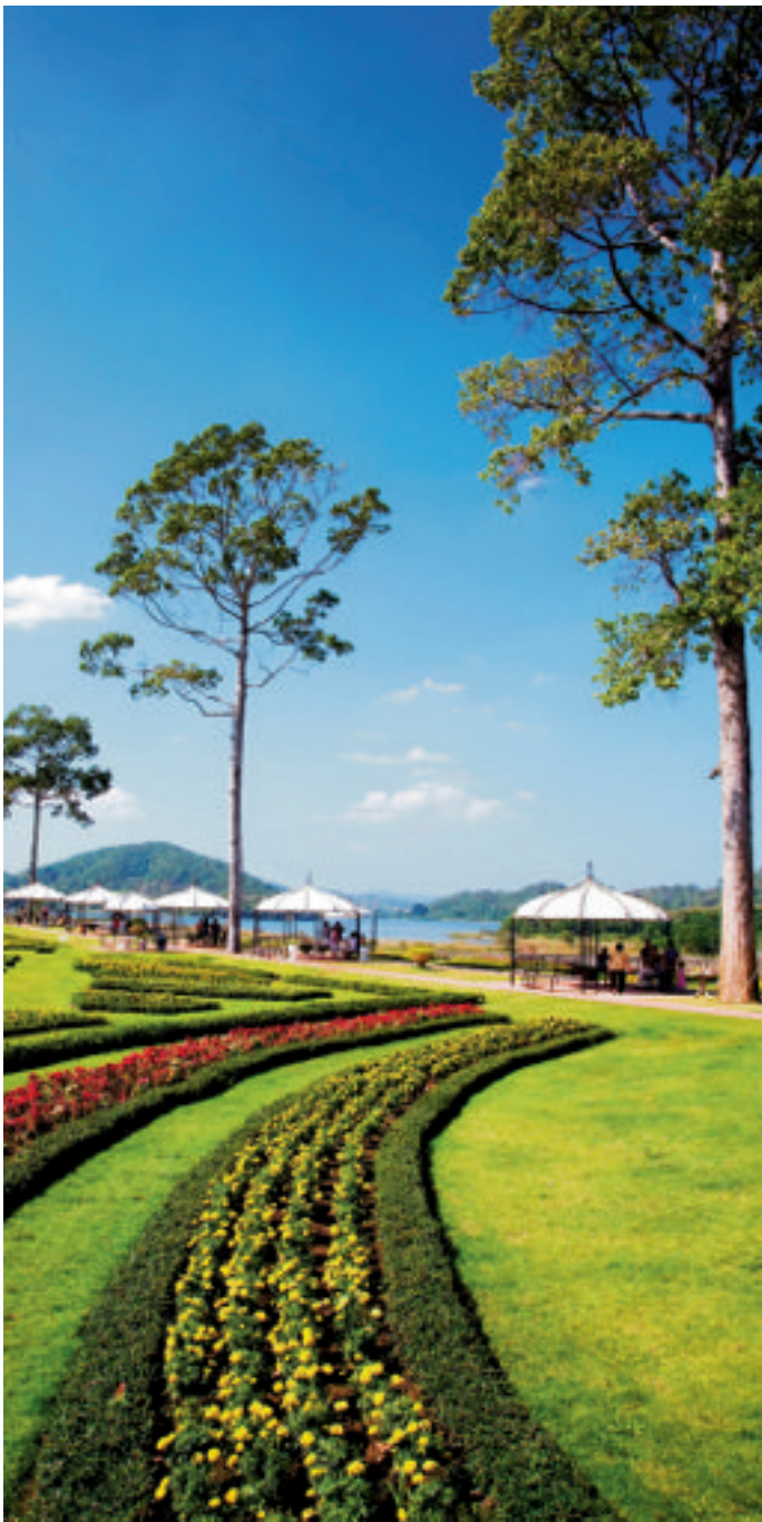
Silverlake Pattaya Grape Escape