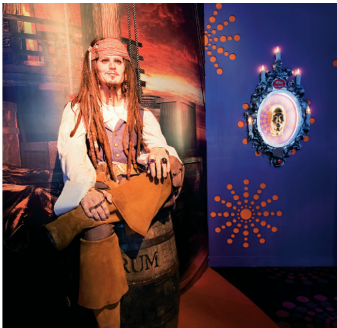
Louis Tussaud's Waxworks