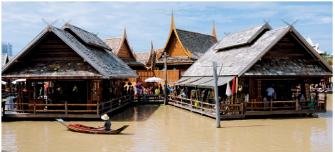
Pattaya Floating Market

are also displayed in the section called “miniworld”. The compound is open daily from 7.00 a.m.-10.00 p.m. Admission: 300 baht for adults and 150 baht for children. Tel. 0 3872 7666, 0 3872 7333, www.minisiam.com for more information.