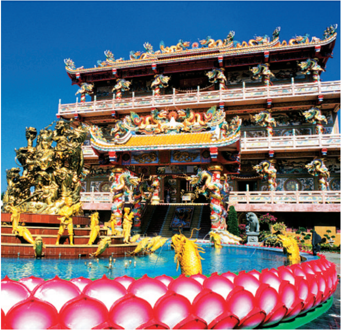
Wihan Thep Sathit Phra Kitti Chaloem or Nacha Sa Thai Chue Shrine

Saturday, it is open until 6.00 p.m., while until 8.00 p.m. on Sunday. For more information, Tel. 0 3839 8381-4, 0 3839 8399.