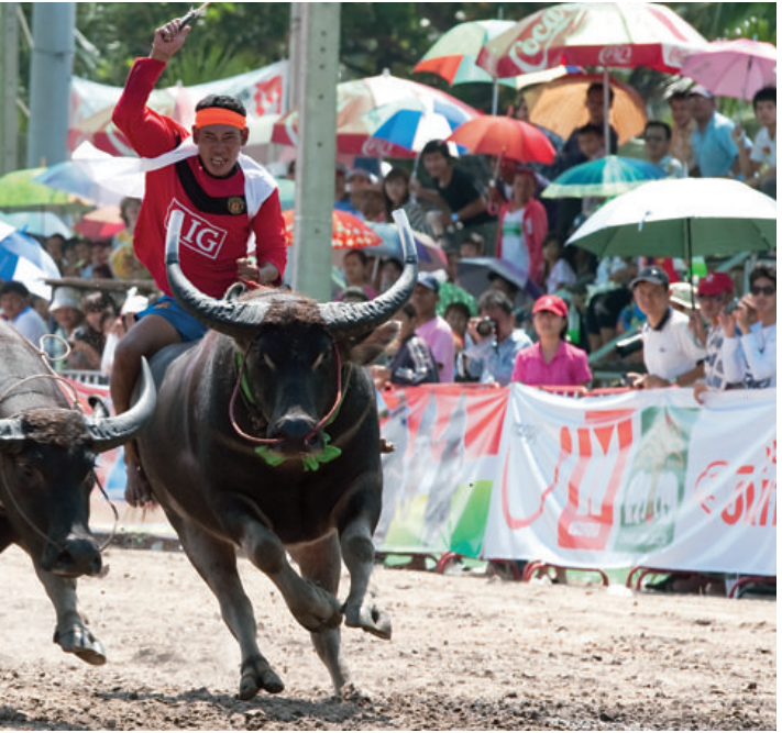
Chon Buri Buffalo Racing

The Legend of Hae Pha Ya Yom (ประเพณีแห่พญายม-สงกรานต์ บางพระ) is an old folk tradition long inherited and observed by the people of Bang Phra. It is held annually during 16 – 18 April. Phaya Yom is believed to be a lord of all spirits and devils. To collect every evil attached to him and float onto the sea symbolizes a release of all bad things from the village for the happy livelihood of the villagers. The event features a procession of the replica of Phaya Yom, ceremony performed by a Brahmin, paying homage to the 100-year-old Buddha's footprint, folk games, seafood and local products fair, as well as cultural performances.