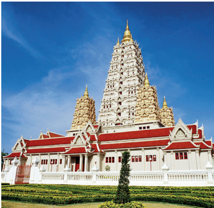
Wat Yanasangwararam Woramahawihan

ancient paintings and pottery. It is open daily from 8.00 a.m.-5.00 p.m. The entrance fee is 50 baht. Tel. 0 3834 3555-57