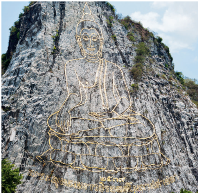
The Laser Beams Carved Buddha Image of Khao Chi Chan