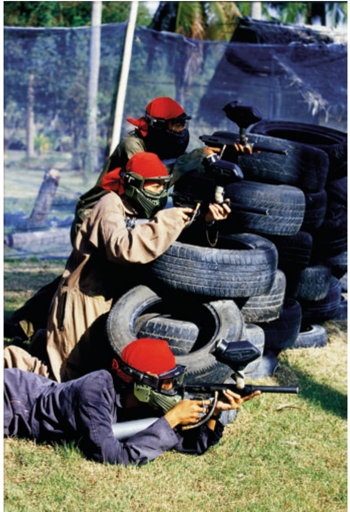
Paintball Park Pattaya

sightseeing flights for visitors to admire the scenery around Pattaya, Jomtien, and Ko Lan. The rates are 4,200 baht for 20 minutes, 5,900 baht for 30 minutes, and 11,000 baht for 1 hour for 3 passengers. Skydiving is also available on weekends. For enquiries, please call Tel. 08 6374 1718, 08 6374 1719, or visit www.pattayaairpark.com .