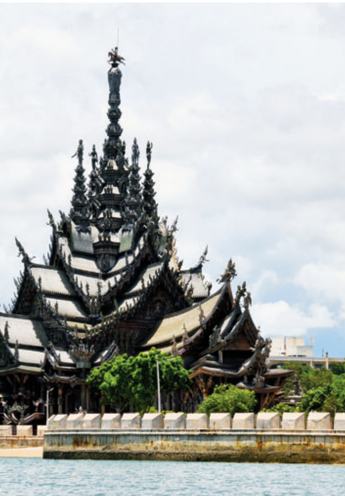
The Sanctuary of Truth