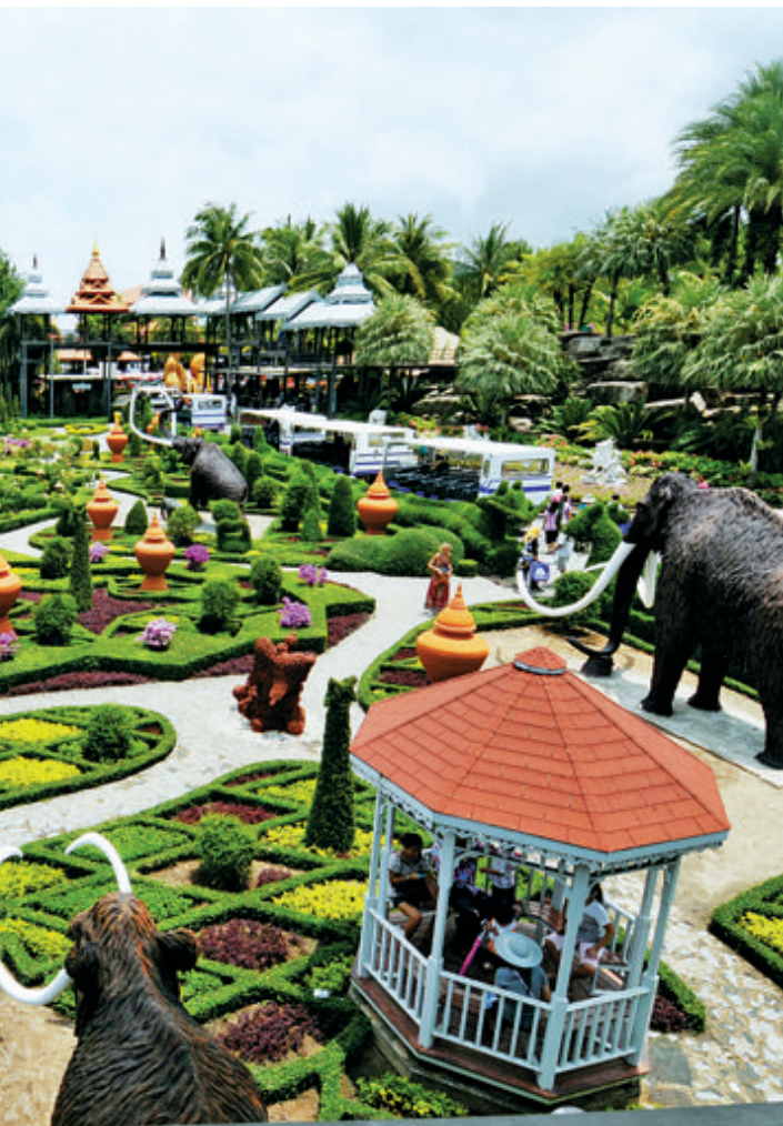
Nong Nooch Tropical Garden