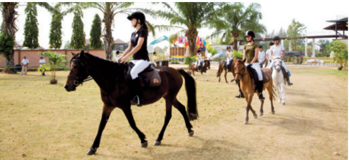
Horseshoe Point Club

Horseshoe Point Club (ฮอรัลพูนท์ พอยท์) is at 100, Tambon Pong. It is a place of horse riding training and accommodation located on Phon Prapha Nimit Road, (the similar entrance as the Siam Country Club), approximately 10 kilometres off Sukhumvit Road at Pattaya Klang. It covers an area of 300 rai. There are horse riding training fields for both indoor and outdoor, crosscountry jumping and polo, which are up to an international standard. Moreover, the performance of the high-level art of Dressage or horse dance is presented. Open daily from 8.00 a.m.-6 p.m. For more information, Tel. 0 3873 5050, 0 3824 8026 or www.horseshoepoint.com .