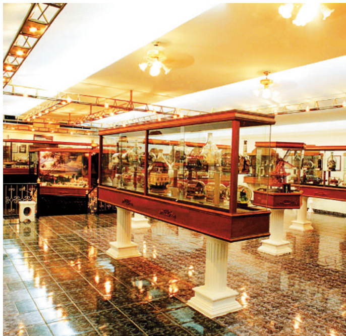
Bottle Art Museum

children. Tel. 0 3842 1428-9 or Bangkok Office at Tel. 0 2633 8114-5 or www.3kingdomspark.com for more information.