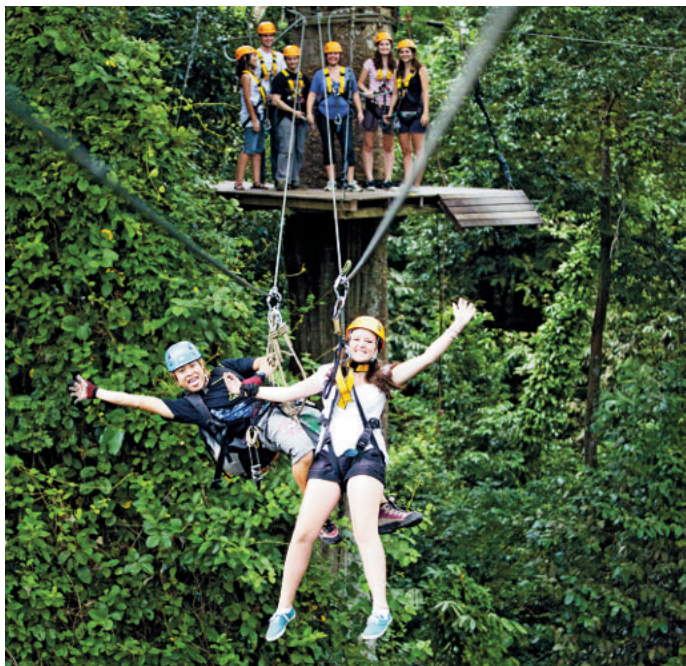
Flight of the Gibbon