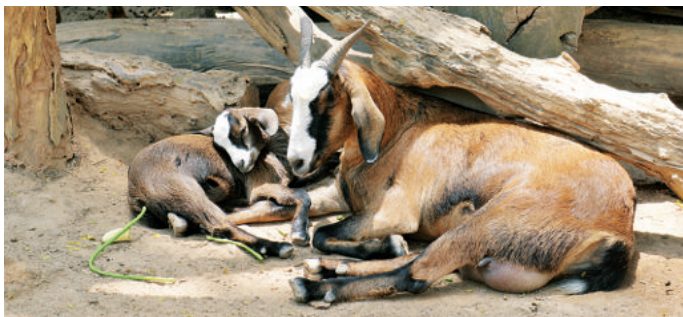
Khao Kheow Open Zoo

birds. Until 11.00 a.m.-4.00 p.m. Admission fee is 300 baht for adults and 50 baht for children. Night Safari admission for adult is 100 baht, children 50 baht tours by auto-trams. Tel. 0 3831 8444 or www.zoothailand.org for more information.