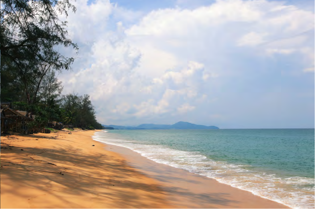
Hat Sai Kaeo