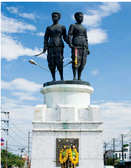
Two Heroines Monument

offers fun for whole family, thrilling rides such as Boomerang and Superbowl as well as wave pool and an aqua play pool for children. Open daily 10.00 a.m.-4 p.m. Admission fee 1,295 Baht for adult and 650 Baht for children. For more information Tel. 0 7637 2111 www.splashjunglewaterpark.com