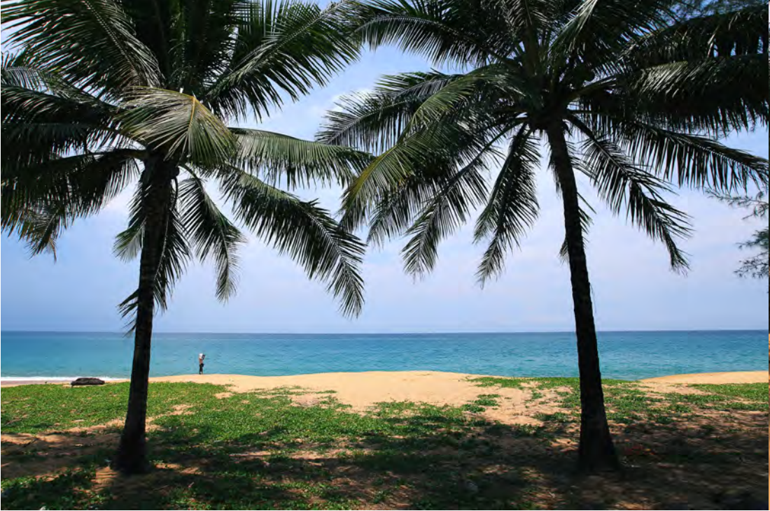
Hat Mai Khao

Park covers an area of 90 square kilometers. The Park stretches all the way to the island's northern tip. There are interesting beaches to visit: