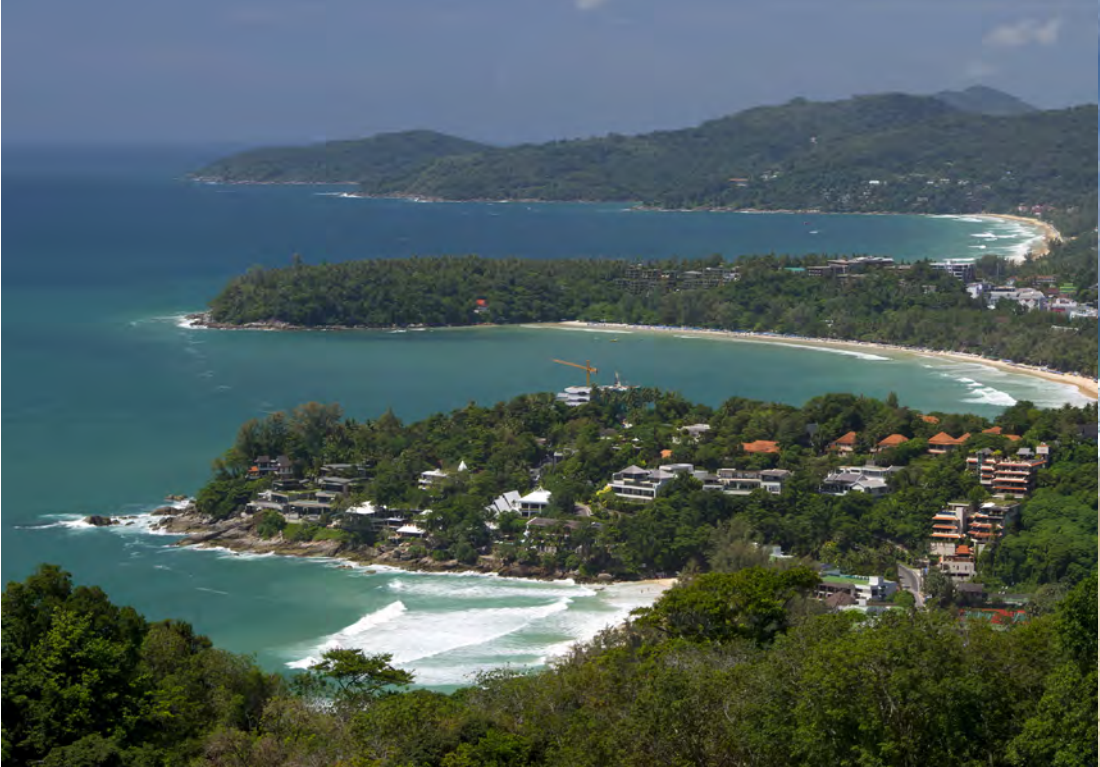
Karon View Point

is generally less crowded than other spots on the southern part of the island. A wide variety of water sports can be enjoyed, but swimmers should be alert for the red flag which warns of dangerous currents during the moonsoon season from May to October.