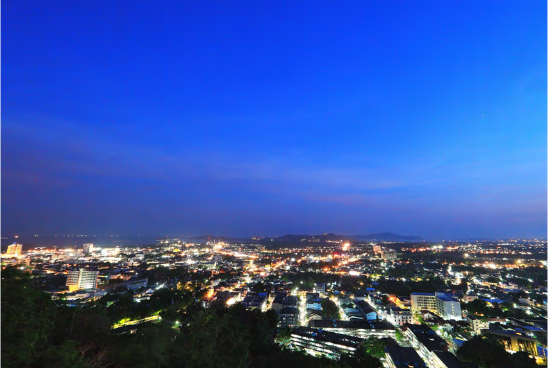
Khao Rang View Point