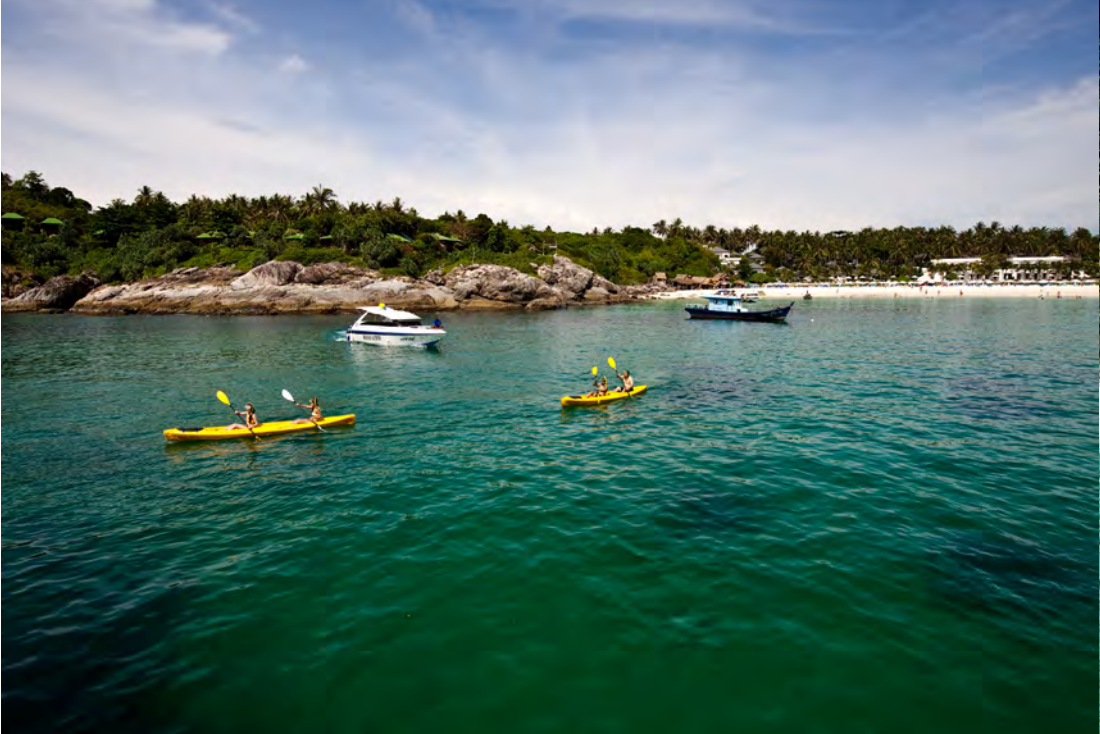
Ko Racha Yai or Raya Yai