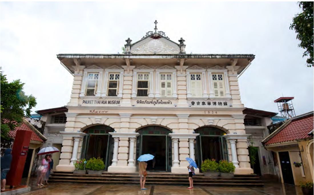
Phuket Thai Hua Museum