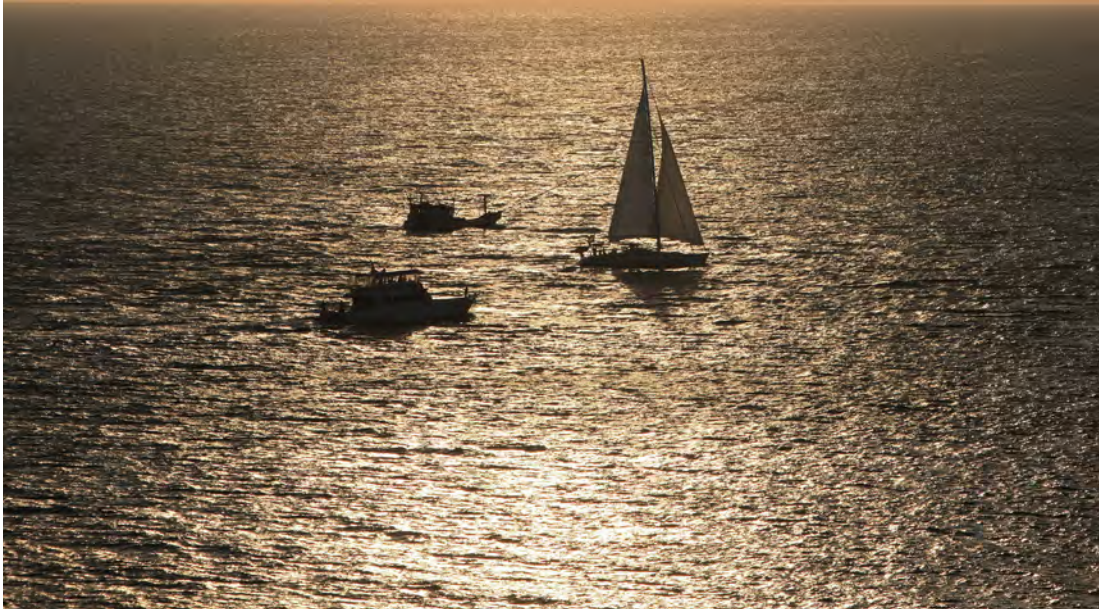
Yachting, Laem Phromthep

Windsurfing Boards may be rented by the hour, half day, full day, or week at most major beaches.