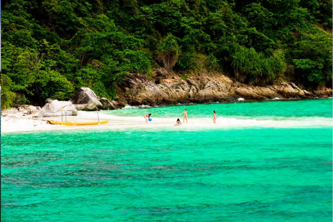
Ko Racha Noi or Raya Noi