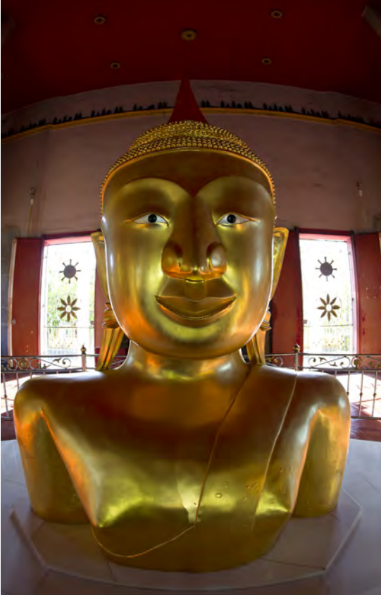
Wat Phra Thong or Wat Phra Phut

Open daily, except national holidays, from 09.00 a.m.–04.00 p.m. Admission fee 100 Baht. For more information Tel. 0 7637 9895