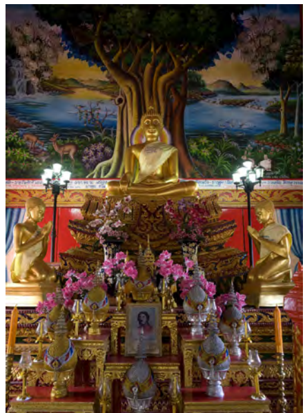
Wat Phranang Sang

One species of palm, the Governor’s Palm or White Back Palm (pam lang khao in Thai) is especially rare. Khao Phra Thaeo also serves as one of Phuket’s most important water sources. Major attractions include: