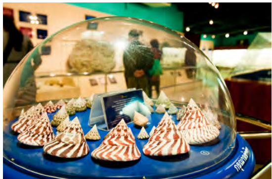
Phuket Seashell Museum

To get there: From Chalong circle (5 Yak Chalong)