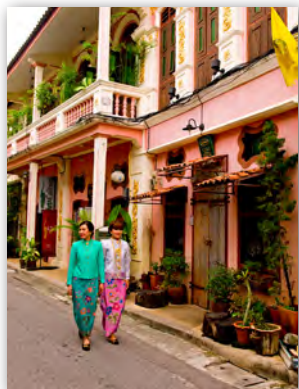
Old Phuket Town