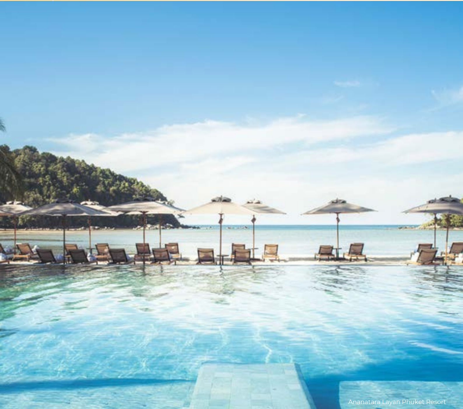
Anantara Layan Phuket Resort