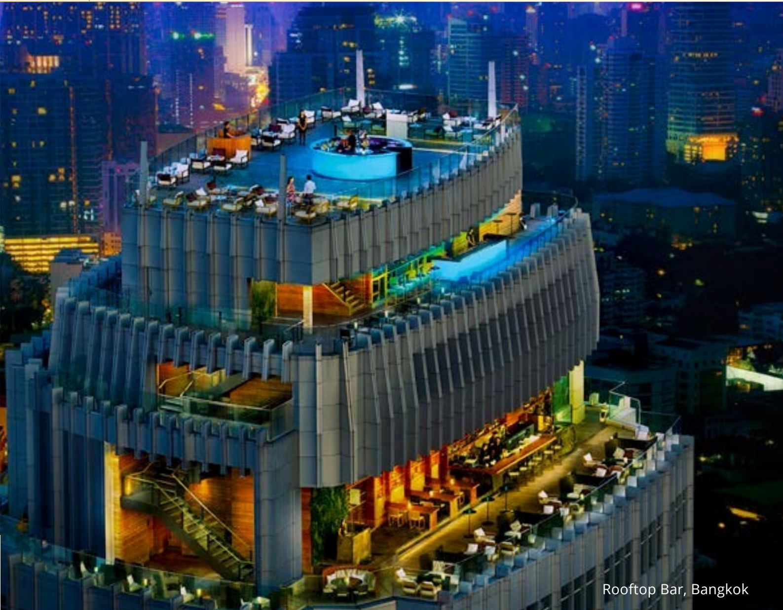
Rooftop Bar, Bangkok

The Chef's Table at the famous lebua in Bangkok wows guests with its treatment of gastronomy as art, where the dinner theatre allows you to watch the chef prepare your cuisine in the open kitchen. Also at lebua, you can savour a luxury dinner at the sky-high rooftop drinking and dining area The Dome, and - what isn't so well known - you can rent out an area at the very top, for half-a-million Baht. Still at lebua, there's the amazing Sirocco rooftop restaurant, synonymous for fine dining, exquisite wines, and breathtaking views across Bangkok.