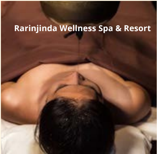
Rarinjinda Wellness Spa & Resort

In the royal beach resort of Hua Hin, at Chiva-Som - consistently rated as one of the best destination spas in the world - you can relax with a choice of luxurious spa treatments and wellness rituals, designed to leave you feeling blissful and contented. In Kanchanaburi, you can take a longtail boat ride to discover the Rock Valley Hot Spring, where there are multiple hot springs that offer relaxation and rejuvenation in a tropical jungle setting.