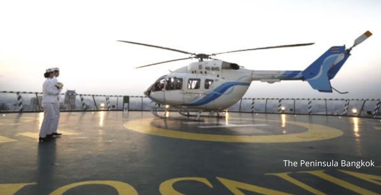
The Peninsula Bangkok