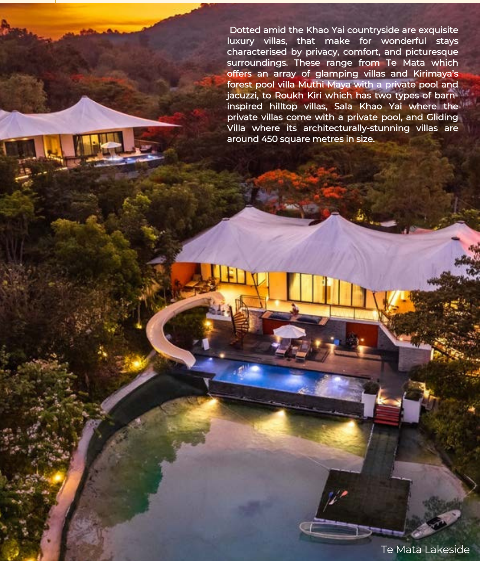
Te Mata Lakeside

Dotted amid the Khao Yai countryside are exquisite luxury villas, that make for wonderful stays characterised by privacy, comfort, and picturesque surroundings. These range from Te Mata which offers an array of glamping villas and Kirimaya's forest pool villa Muthi Maya with a private pool and jacuzzi, to Roukh Kiri which has two types of barn-inspired hilltop villas, Sala Khao Yai where the private villas come with a private pool, and Gliding Villa where its architecturally-stunning villas are around 450 square metres in size.