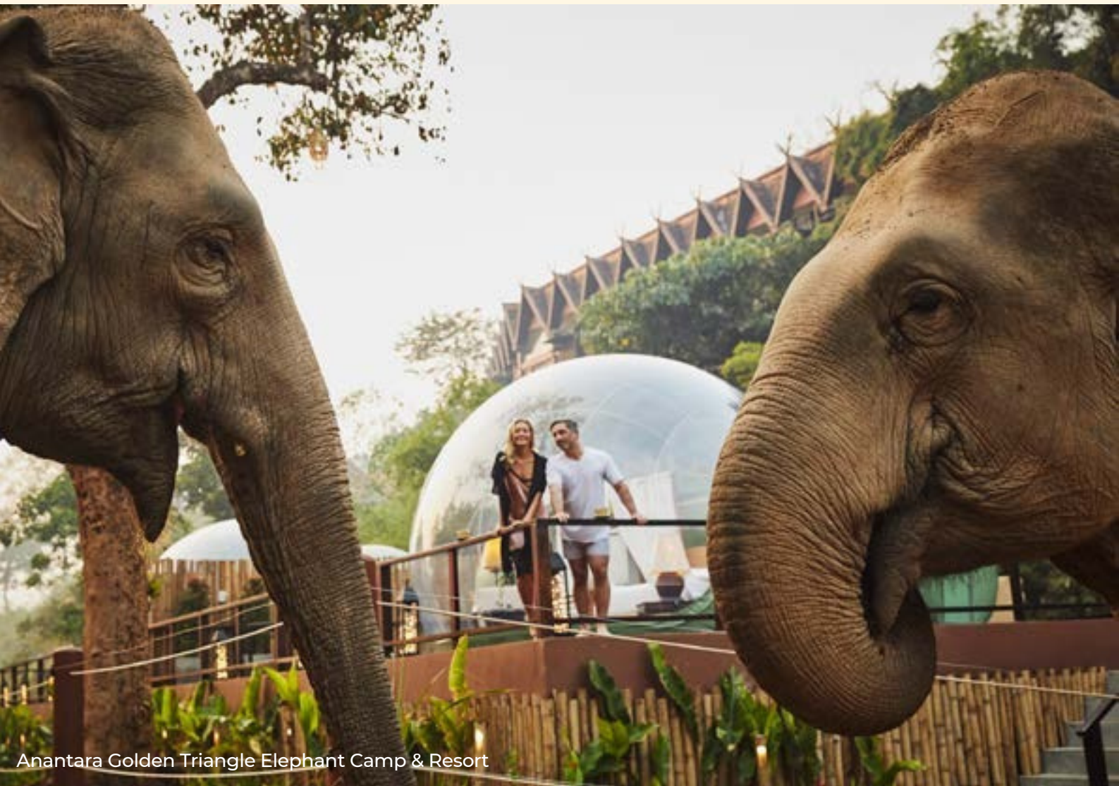
Anantara Golden Triangle Elephant Camp & Resort

In Chiang Rai, Four Seasons Tented Camp Golden Triangle offers all-inclusive luxury accommodation and meaningful travel activities including outdoor spa treatments amid the bamboo forest, interacting with rescued elephants, exploring mountain trails, and enjoying a private barbecue dinner under the stars. At Anantara Golden Triangle Elephant Camp & Resort, you can watch elephants grazing from the comfort of your suite or from an air-conditioned and transparent Jungle Bubble.