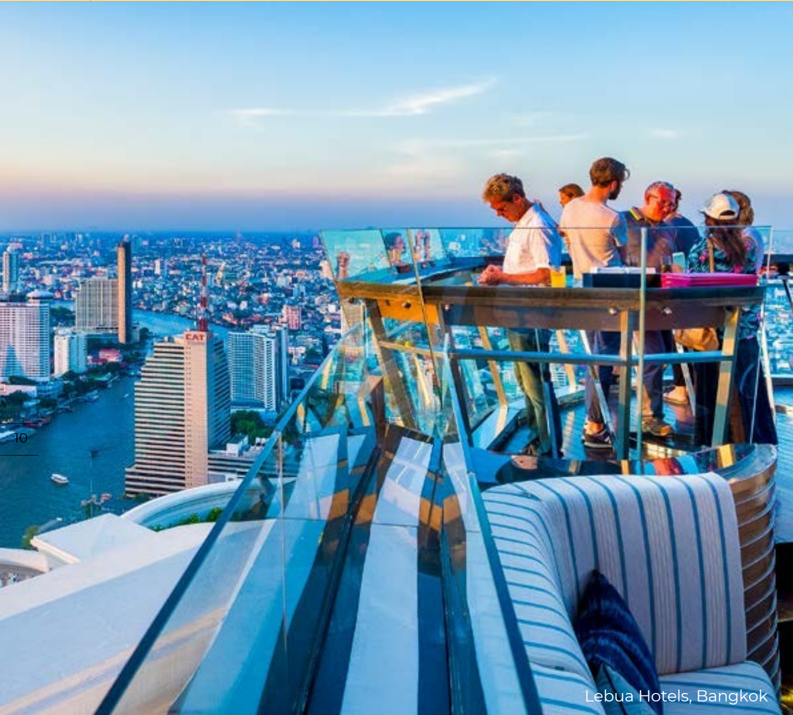
Lebua Hotels, Bangkok