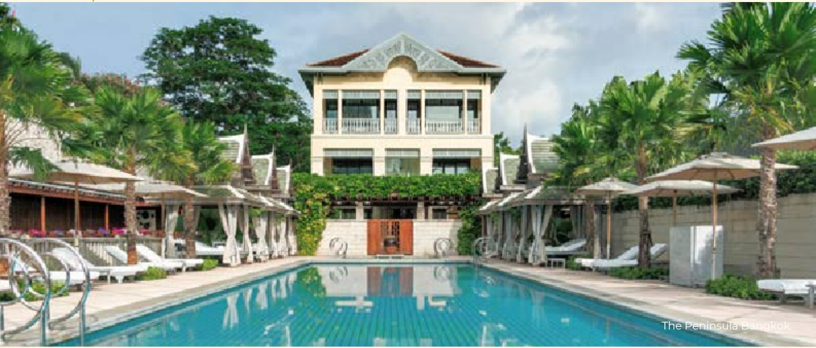
The Peninsula Bangkok