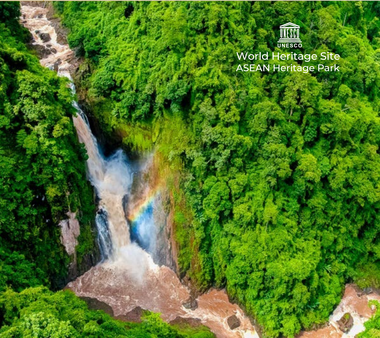
Haewnarok waterfall, Nakhon Ratchasima