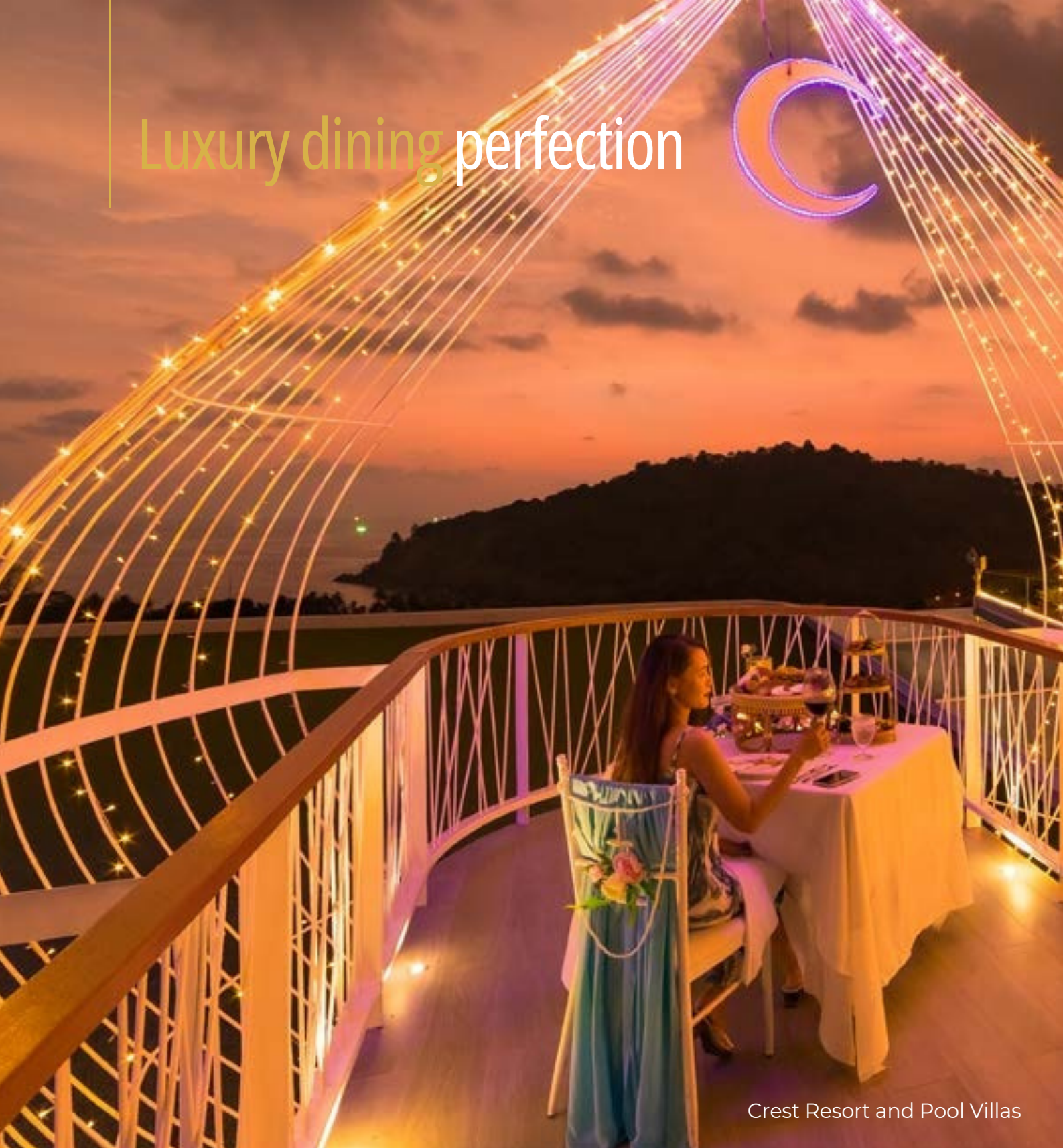
Crest Resort and Pool Villas

The possibilities for ultra-luxury dining in Thailand must be seen to be believed. From exclusive chef's table affairs to Michelin-starred restaurants, and sky-high rooftop restaurants with the most amazing of views, Thailand excels in the exquisite cuisine served and the impeccable service delivered.