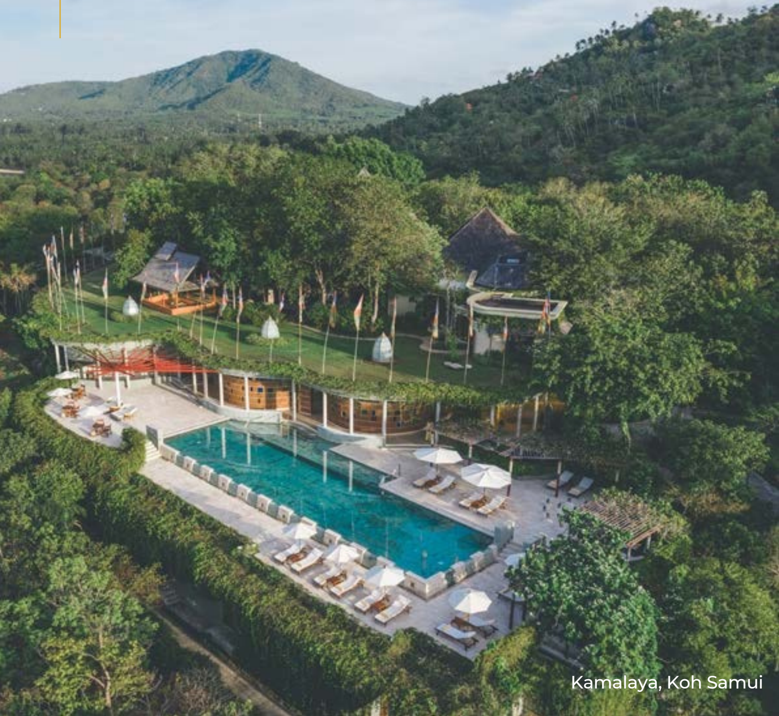
Kamalaya, Koh Samui

Thailand's luxury accommodation scene is second-to-none. International brand 6-star hotels pamper their guests with every wish catered to, exclusive resorts are ultra-luxurious in every aspect, and the impeccable service on offer to the most discerning of guests is - for want of a better word - perfection. Complementing the finest in luxury accommodation is the choice of fantastic locations around Thailand in which this can be enjoyed, from postcard picture - perfect beaches to dramatic, wild landscapes to mist-shrouded hills and valleys.