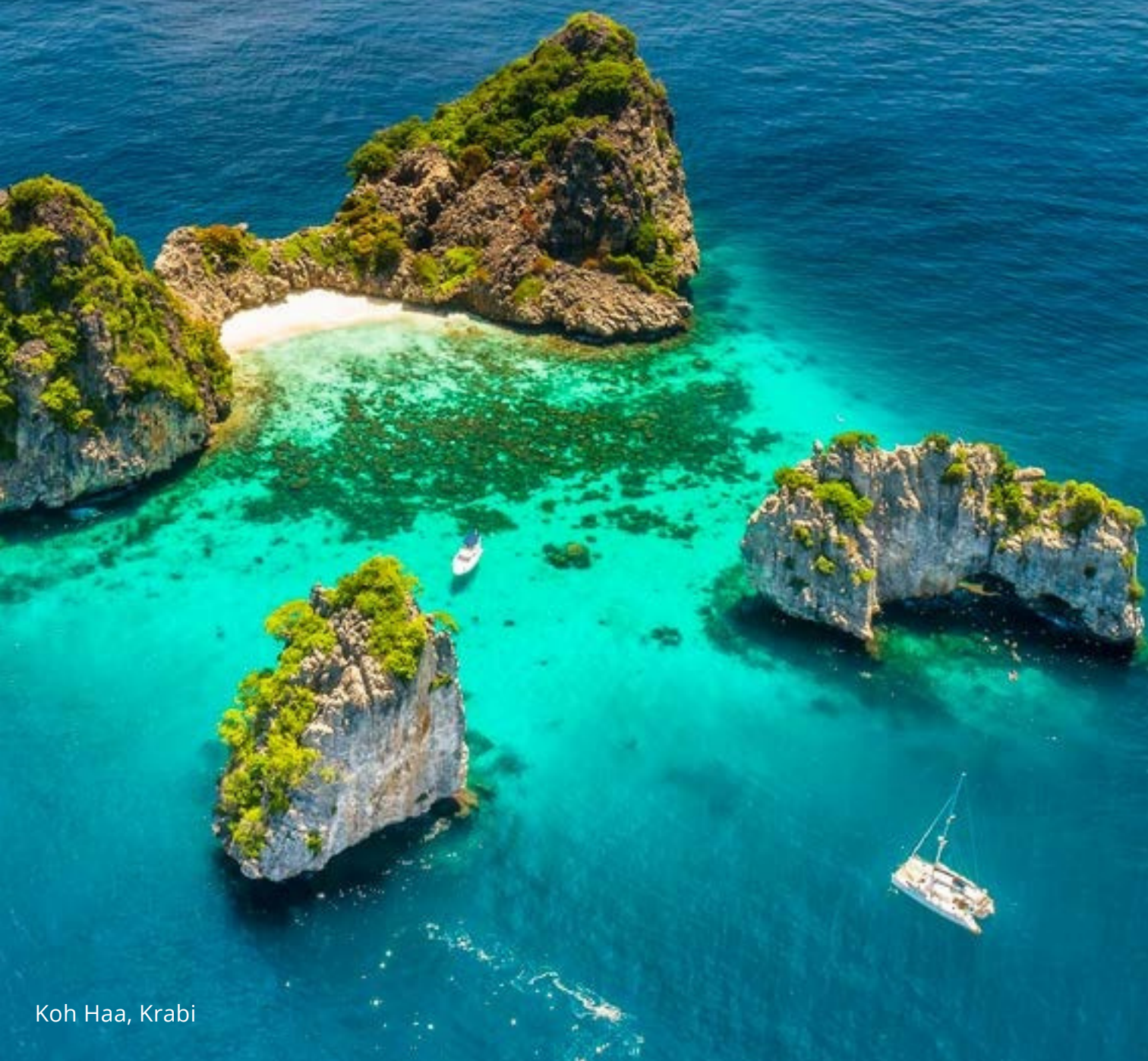
Koh Haa, Krabi

Thailand is well known among the most discerning of travellers as an ultimate luxury destination of choice, a reputation well-earned and admired by those who appreciate luxury from all corners of the world.