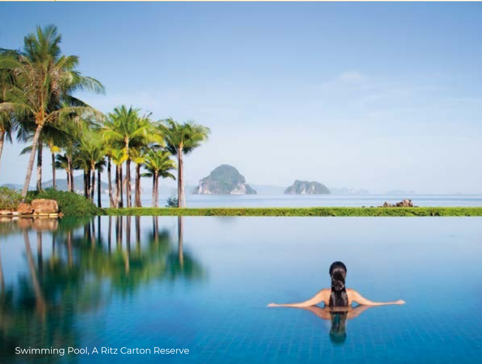
Swimming Pool, A Ritz Carton Reserve