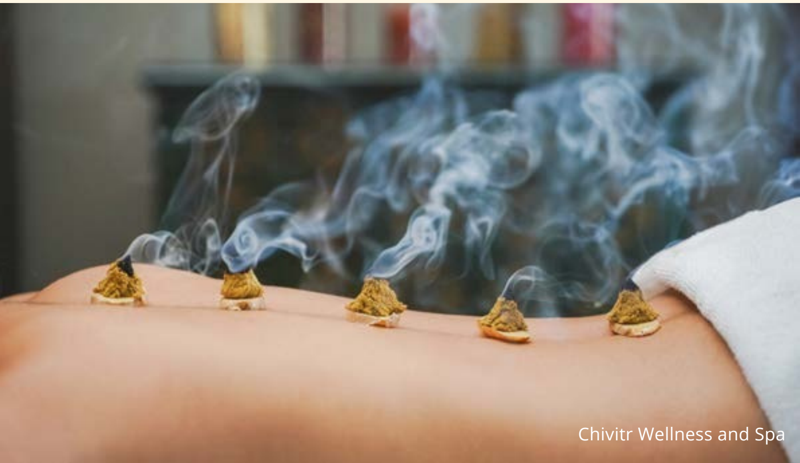
Chivitr Wellness and Spa

Located within Bangkok's 'Green Lung' is RAKxa, a luxury wellness retreat that delivers bespoke healthcare in relaxing surroundings on the banks of the Chao Phraya River. Here you can relax, tune in and unleash your core,