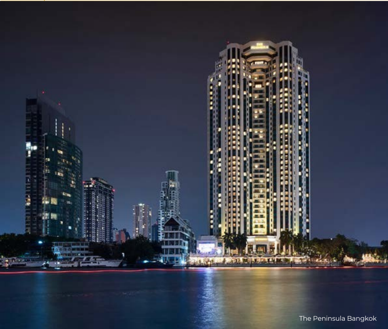
The Peninsula Bangkok

Among these is the legendary Mandarin Oriental, Bangkok which sits on the banks of the Chao Phraya River and is consistently praised as one of the world's best hotels. The Peninsula Bangkok is another prestigious address, where the rooms and suites all command magnificent Chao Phraya River views. Describing itself as an urban oasis in the heart of the city, Siam Kempinski Hotel Bangkok offers