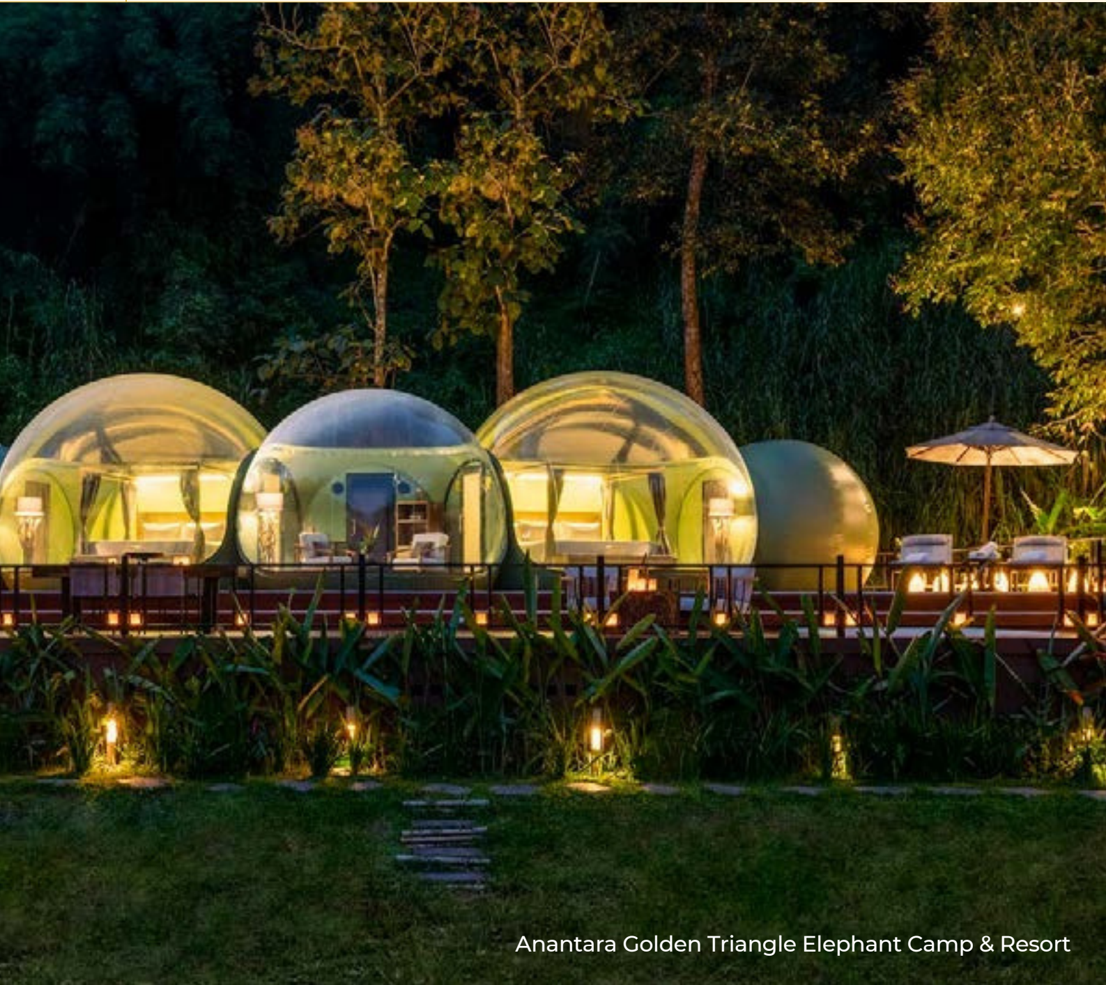
Anantara Golden Triangle Elephant Camp & Resort