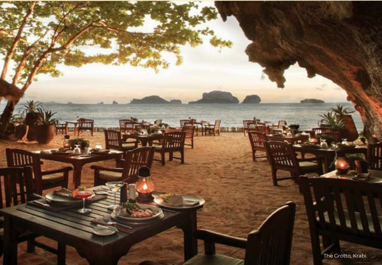
The Grotto, Krabi

Half way between Phuket Half way between Phuket and Krabi, Six Senses Yao Noi sits amid the limestone pinnacles of Phang-nga Bay, offering private pool villas attended by a Guest Experience Maker (GEM) trained to anticipate guests' every whim. In Khao Lak, Phang-nga, luxury beach resorts include The Sarojin, which features luxury guest residences set in lush tropical gardens, and Casa de La Flora with contemporary slate-grey cube villas with large glass facades.