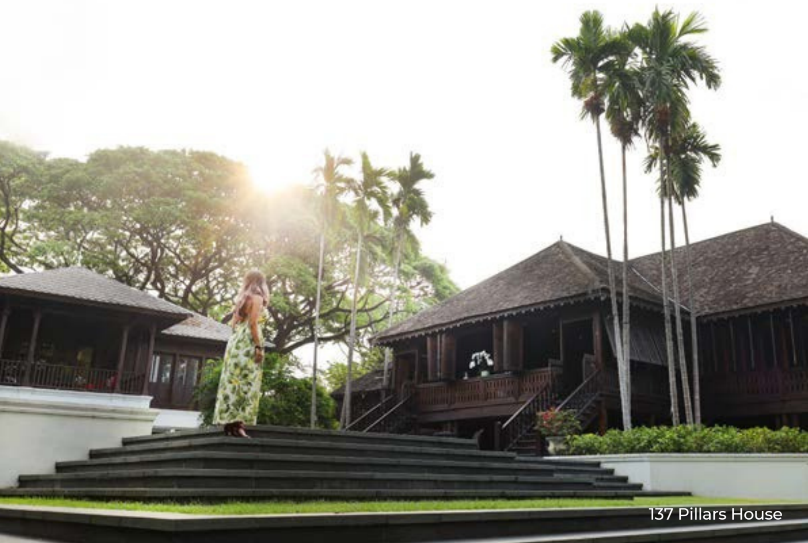
137 Pillars House

In Chiang Mai, Four Seasons Resort Chiang Mai allows guests to bask in a gorgeous setting of tropical gardens and rice paddies, and traditional Lanna-style architecture. Meanwhile, the award-winning 137 Pillars House Chiang Mai boasts a rich colonial past, having been built around an original colonial teak homestead from the late 1800s, and Anantara Chiang Mai Resort offers a perfect blend of riverside serenity and local attractions and activities, also boasts a heritage house that once served as the British consulate.