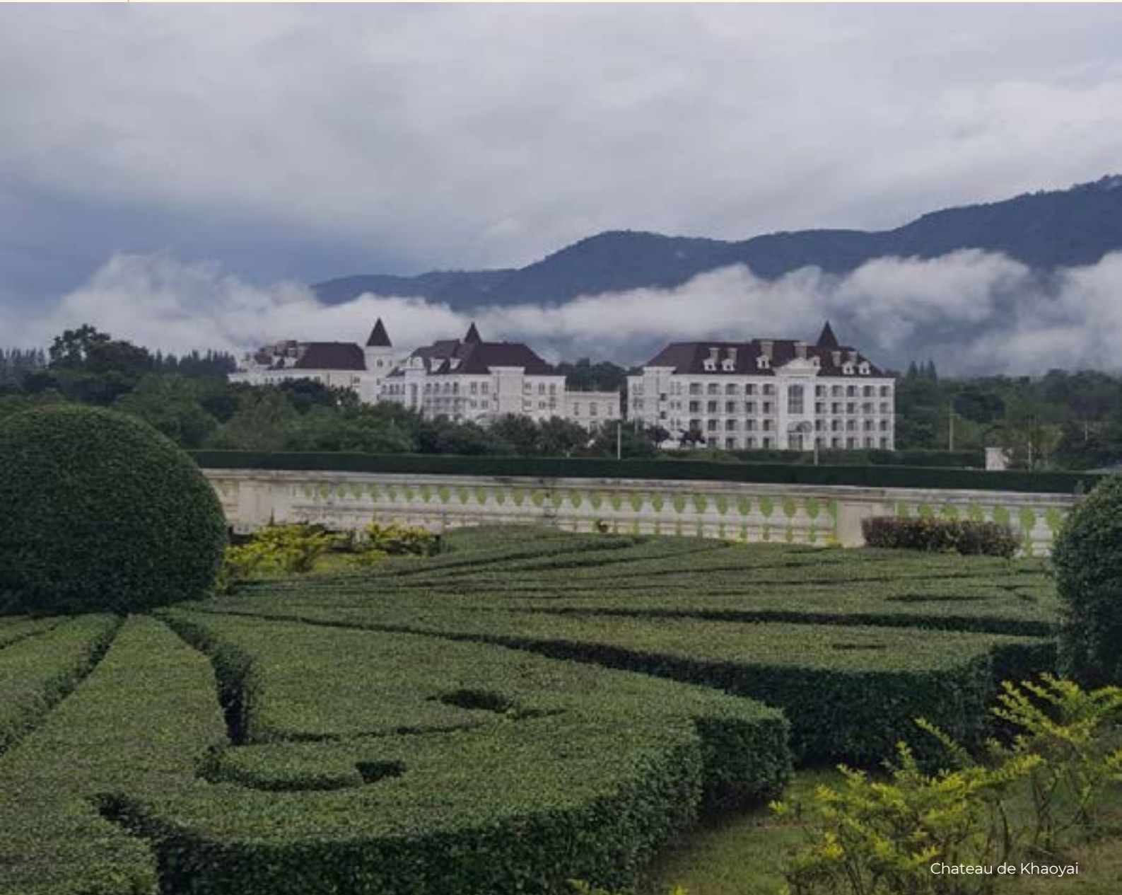
Chateau de Khaoyai

Inspired by central European aesthetics, in particular the sophistication and grandeur of French architecture, the majestic Chateau de Khaoyai rises like a grand beacon from the tropical Pak Chong landscape. Guests staying here can truly feel like European royalty, in the opulence of the European-inspired chateau, lakeside villa, mountain villa and other accommodation options.